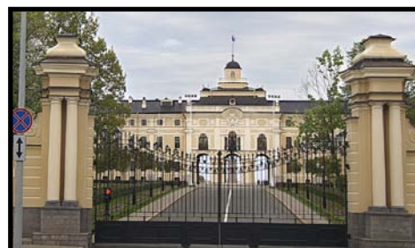
3. Putin's Palace at 50mph, 1/1000 th , f:5.6, ISO 800