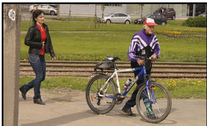
1. Bus Stationary: 1/320, f:5.6, ISO 400