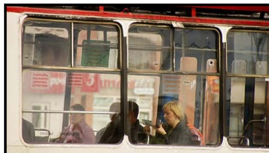
2. At about 25mph, 1/500 th , f:6.3, ISO 400